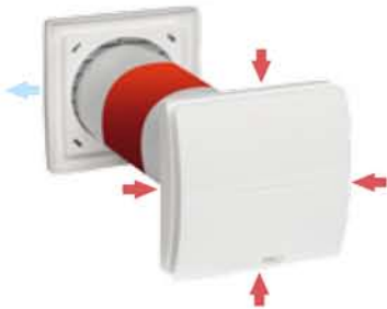
Unit on extraction and heat retention mode