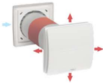
Unit on supply and heat transfer mode